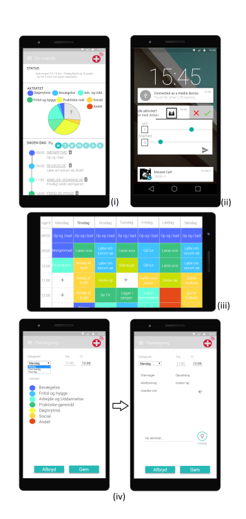
Figure 2: Screenshots of the Moribus prototype.

short-term consultations and problem solving technique. However, in a large 16-week randomized trail [2] it was found that behavioral activation (BA) alone was as effective as pharmacotherapy and both treatments were significant better than cognitive therapy (CT). The treatment plan for BA starts with the patient reporting his/her activity every hour for several weeks [7]. This is done on a print-out of a week schedule typically between 8am and 11pm. The activity is provided with a score on 'mastery' (i.e., the level of accomplishment) and 'enjoyment' (i.e., how pleasant was the activity?). Together with a psychologist the patient then identifies activities that reinforces depressed and healthy behavior [7]. This information is then used to plan activities of the following week.