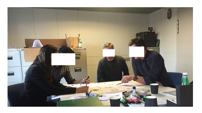
Figure 3: Discussion at a design workshop.

To inform the design of the system, biweekly user-centered design meetings have been conducted over a period of 12 months at the Psychiatric Center Copenhagen, applying the Patient-Clinician Designer (PCD) framework [8]. The process has included patients (2), a psychologist (1), psychiatrists (2), computer scientists (2), and a biomedical engineer (1). An image from one of the workshops is shown in Fig. 3.